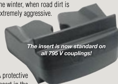
The insert is now standard on all 795 V couplings!

The protective insert is most useful during the winter, when road dirt is extremely aggressive.