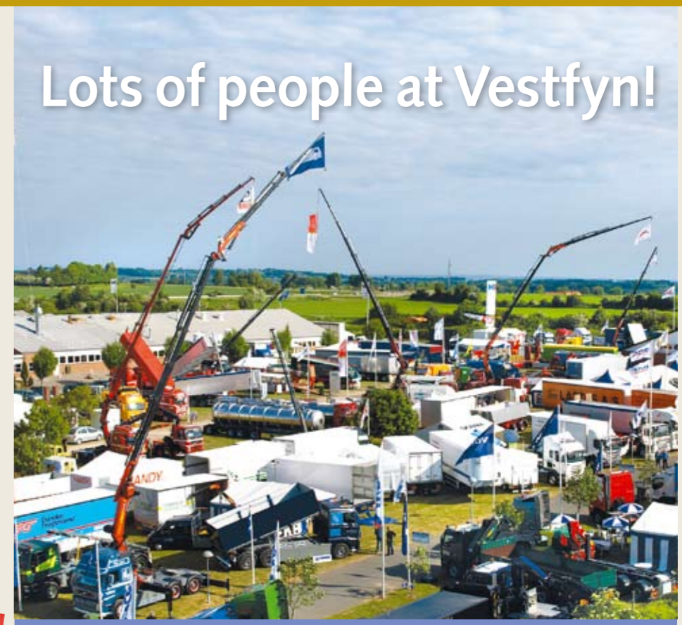
Lots of people at Vestfyn! For once the sun shone over the 'Vestfyn Trækker', VBG Denmark's own trade fair. Exhibitors and visitors alike were, not surprisingly, in a good mood, and many of the showcases were very busy. Most of the exhibitors reported a good turnover and many of them have already applied to the next exhibition in 2010, which will be held on May 29-30!